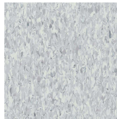
727 EIFFEL TOWER 300 x 300mm