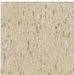
1102 PEBBLE 300 x 300mm