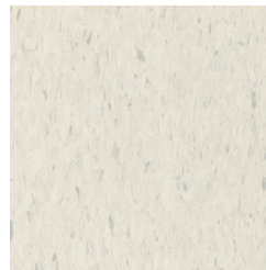
2230 NOUGAT 300 x 300mm

With regard to colour printing, it is only possible to give a provisional representation of the product colour. For colour selection an original sample should be used, which we shall be pleased to supply free of charge. To replicate the natural material, the stone effect tiles may include variation in markings as part of their design.