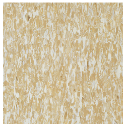
173 CAPPUCCINO 300 x 300mm