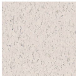
2222 MOSSMAN 300 x 300mm