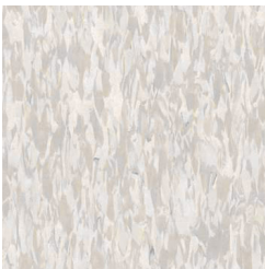
157 MOONDUST 300 x 300mm