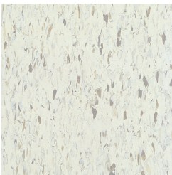
1117 MERINO 300 x 300mm