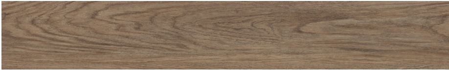
HAZEL OAK 9790