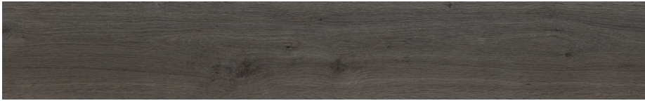
WINSLOW OAK 9798