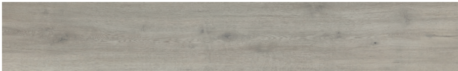
OYSTER BIRCH 9739