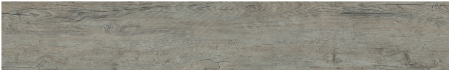
SEASONED GREY OAK 9795