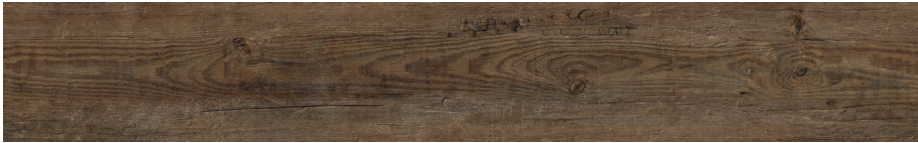
HUCKLEBERRY OAK 9793