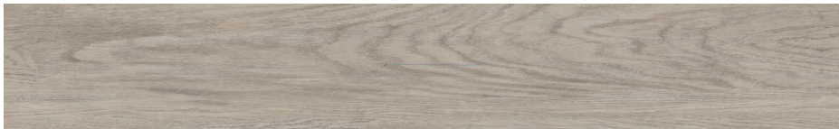
FRENCH LIMED OAK 9784