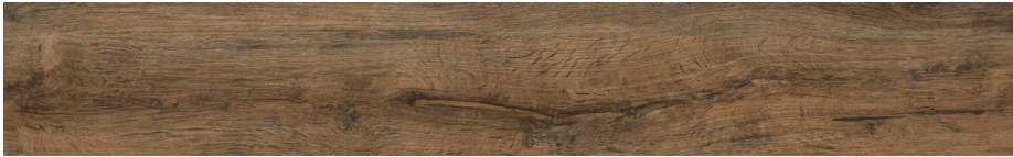
FLAMED CHESTNUT 9792