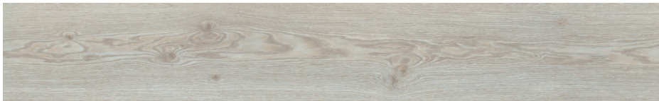
PLANED WHITE OAK 9783