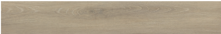
LONG BEACH OAK 9799