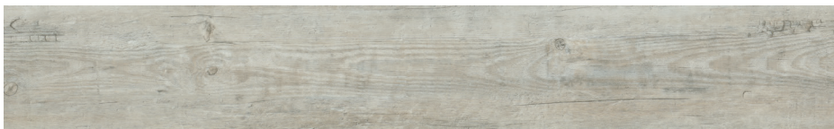
CRACKED WHITE OAK 9782