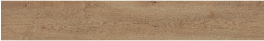
SAW MILL OAK 9788