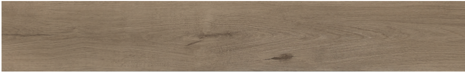
TAMARIN OAK 9738