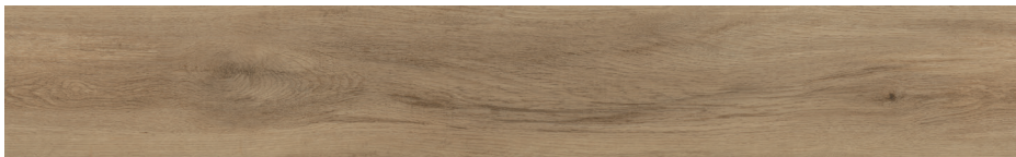
HARVEST OAK 9787