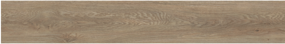
DAPPLED OAK 9786