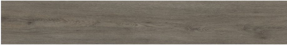
GREY PORT OAK 9797